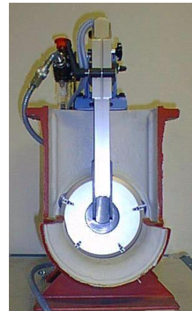
Customized model SC-FL for lack of space above valve flange. Note the low mounting frame compared to valve size.